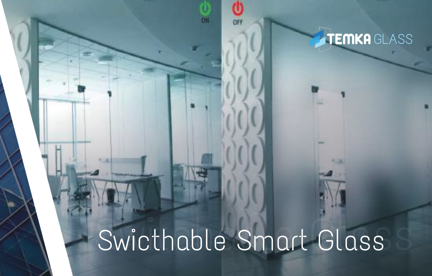
Swicthable Smart Glass